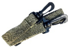
Carrying Case Strap