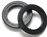
Demist Shields (2)