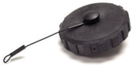
Battery Cap Assembly