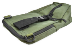
Carrying Case, Unmarked