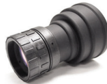
Objective Lens Assembly